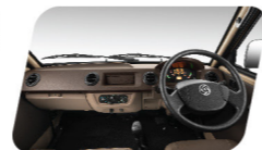
DUAL TONE INTERIORS

For further details, please contact: 1800 1022 666 (toll-free) www.ashokleyland.com Or write to us at: Ashok Leyland Limited, 6th Floor - LCV Marketing, No.1 Sardar Patel Road, Guindy, Chennai - 600 032. Tel: (044) 22206000